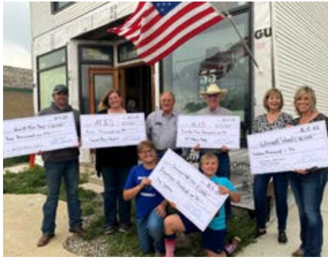
The Lawrence and Kathleen Carrell Donor Advised Fund with CMF has granted $114,400 to local projects this year and another $10,000 in scholarships.