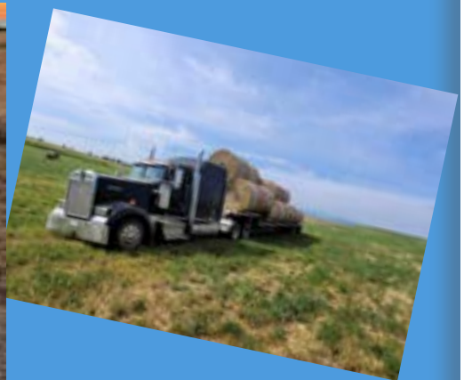
The Jackson Ranch