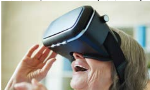
MCF grants included funding for a Virtual Realty for hospice patients.

• Home Health, $500: This is a grant from a Home Health family who designated their gift for a staff appreciation event. The staff held a paint and eat event at the Civic Center.