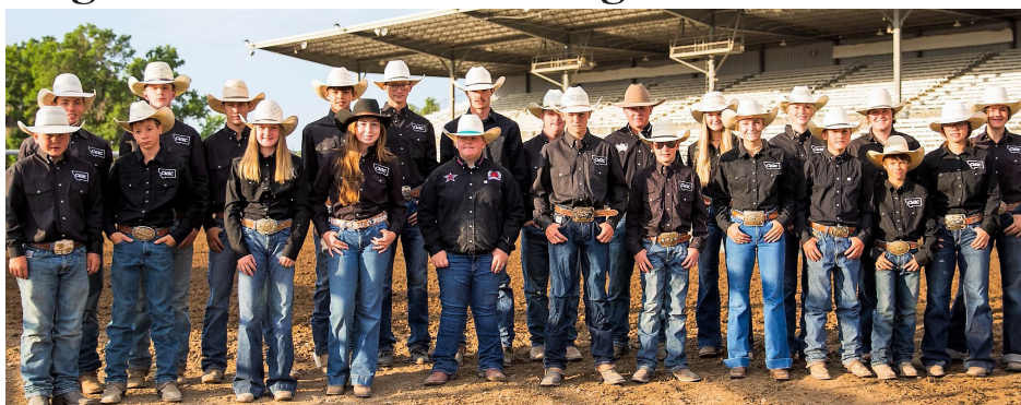
Members of the Central Montana Rodeo Club at this year's event in Lewistown.

Congratulations to the following organizations receiving grants: