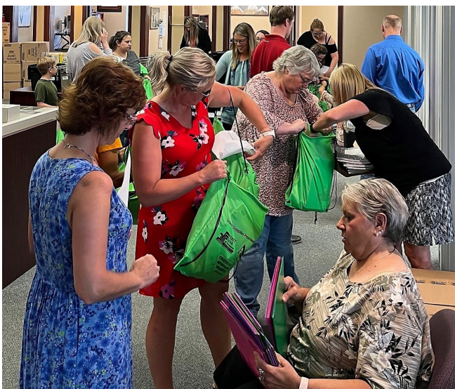
First Bank of Montana staff put together cinch bags of school supplies to give away to local students.