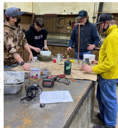
The Fergus FFA Team competing in the Mechanics Contest in January.

To learn more about Fergus FFA Alumni, contact Jordan at 406.366.5748. Donors can make a tax deductible gift by using the giving form on Page 14. ❖