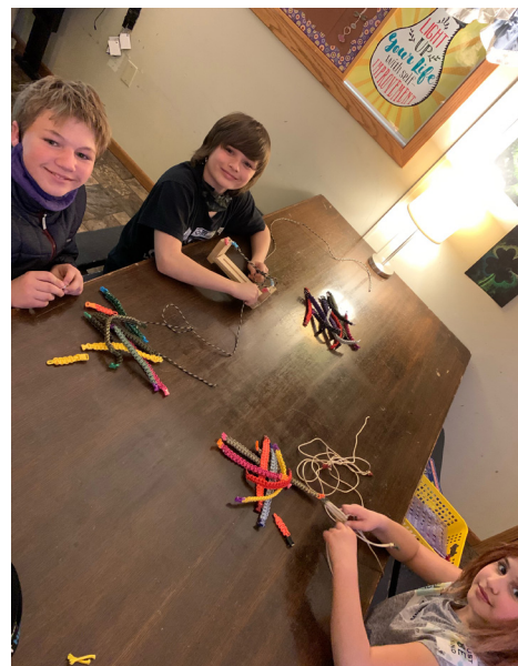
Boys & Girls Club members work on their “Knots 4 Life” bracelets.

For more information on how to purchase a Knots 4 Life bracelet, call Boys and Girls Club at 406.535.2257.