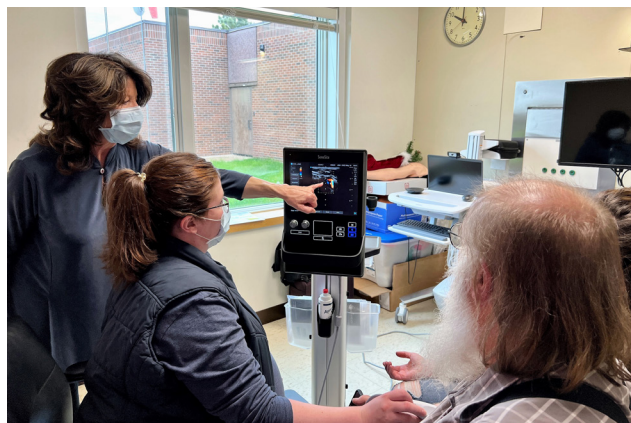
The Sonosite Ultrasound machine has arrived and is in use at Central Montana Medical Center.

• HOSPICE: Home Care and Hospice serve Fergus and Judith Basin Counties seven days per week, most often traveling to provide direct patient care. A grant of $20,000 was awarded to be used for the purchase of a vehicle needed to serve those patients and families.