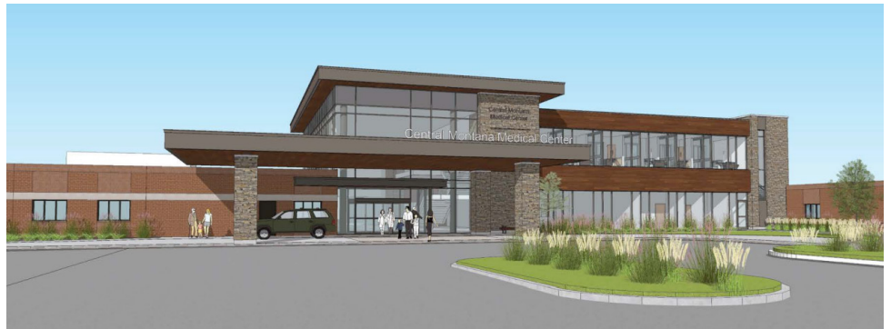
An architectural rendering of the of the CMMC Cancer Center which will be located on the east-side of the facility.