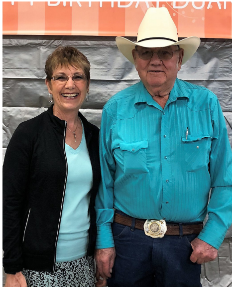
The Duane and Diane Dengel Scholarship will help Stanford students going to trade schools.