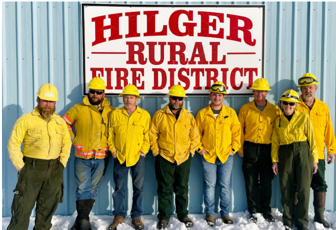
Hilger Rural Fire District volunteers following a recent meeting.

Most of those recipients were directly affected by the West Wind Fire that tore through the town of Denton and its surrounding areas. Requests included everything from covering rebuilding costs to getting reimbursed for livestock losses, and everything in between. Assistance was also given to those impacted by the Taylor Fire that burned southwest of Winifred and the South Moccasin Fire which blanketed the mountains north of Lewistown. The group also oversaw the dispersal of household goods, clothing, furniture, hay, fencing materials and