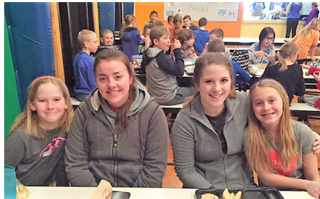
Central Montana Youth Mentoring Program participants before COVID-19 halted get-togethers like this. The program is the recipient of a COVID-19 Relief Fund grant.

CMF Directors awarded two grants from the COVID-19 Relief Fund established