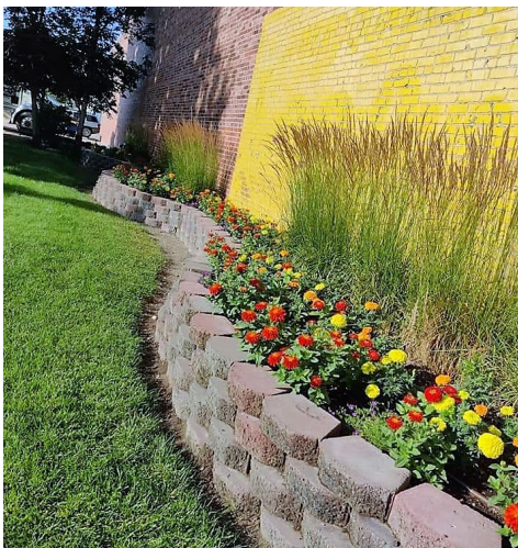
Judith Basin Endowment regularly grants funds for the Stanford Beautification projects.

• PETROLEUM COUNTY ENDOWMENT: Grants were awarded for $2,200 to Winnett Swimming Pool for its pool rehabilitation project; $1,057 to Petroleum County Ambulance for lithium batteries for its Lucas device; $1,000 to Petroleum County Sheriff's Department to help with training and cer-