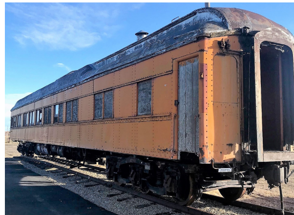
Wheatland County Community Foundation granted funds to help restore this railroad passenger car displayed in Harlowton.

• JUDITH BASIN ENDOWMENT: Grant awards include $1,750 to Operation Santa for holiday meals and gifts for needy families and Blessings in a Backpack; $500 to Geyser Daycare to help with start-up costs, toys and the play yard; $1,500 to Basin Wellness