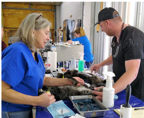
SAFE has organized a number of spay and neuter clinics over the past few years.