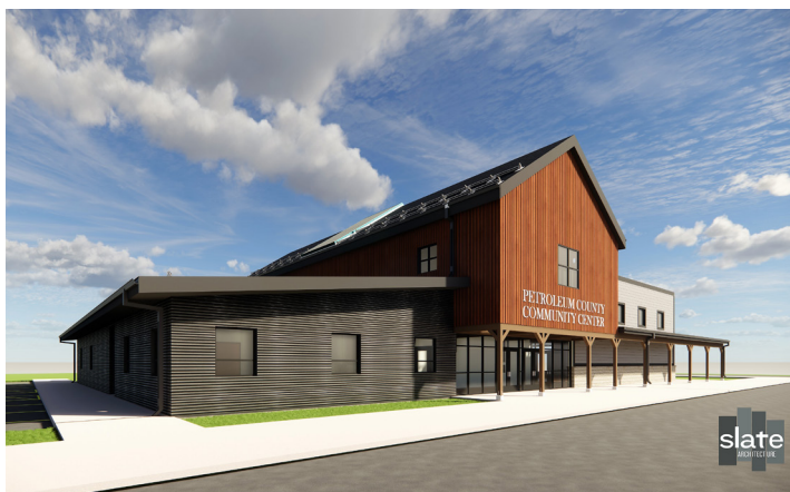
This is a rendering of the Petroleum County Community Center in Winnett.